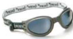
5820GS SMOKE TINT with UV Protection