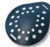
5703CS SMOKE TINT with UV Protection