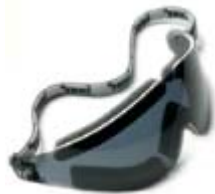
5819D SMOKE with UV Protection